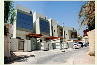
33 Units 2-Storey Villa in Mahooz

Currently, multiple projects are in progress including: